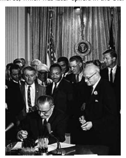
President Johnson signs the Civil Rights Act of 1964. Behind him stands the Rev. Martin Luther King Jr.

discrimination in places of public accommodation, such as hotels and restaurants, as this involved private action, not state action. Supporters felt that the Commerce Clause in the Constitution gave Congress that right because racial discrimination had a negative effect upon interstate commerce; which was later upheld in the U.S.